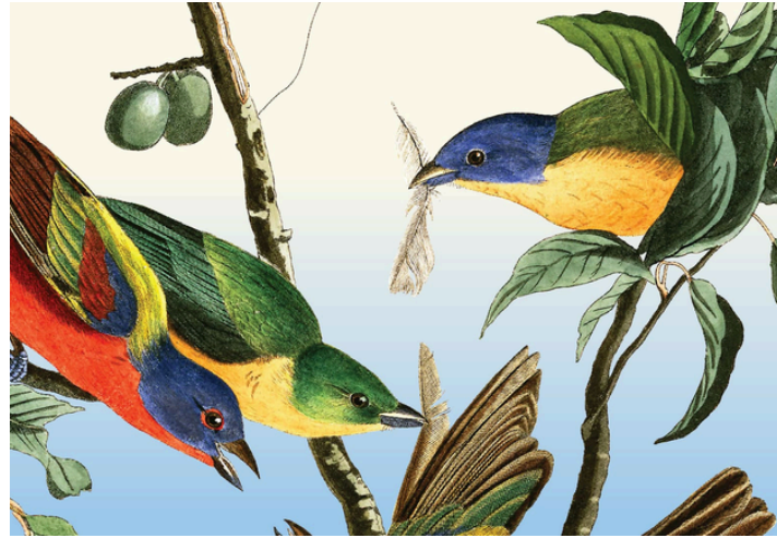
Audubon's Birds of America is produced by the National Museums Scotland in partnership with the Houston Museum of Natural Science.

Enjoy a rare opportunity to see John James Audubon's Birds of America , published as a series between 1827 and 1838. This famous book features life-sized, colorful illustrations of birds and is considered a landmark work in ornithology.